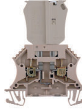
Pluggable Fuse, Single Level 5 x 20 mm fuse

WTR 2.5/SI new with fuse holder for G fuse cartridges 5x20