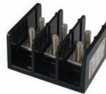
Power Stud Blocks