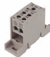
Finger Safe Power Distribution Blocks