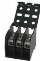
Power Splicer Blocks