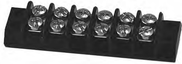
106 / 670A GP 06