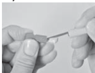
Figure 2 - Full Insertion