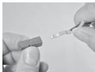
Figure 1 - Inserting Contact Using Insertion Tool